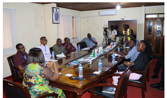
MD together with Senior Management updating the media on activities for the first quarter of the year. This will be a quarterly engagement with the media.