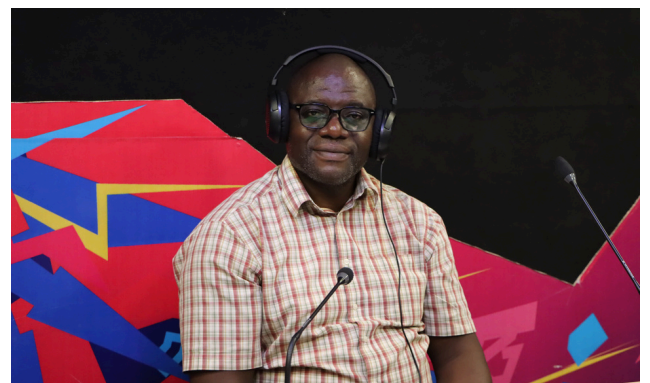
Filling fulfilled after eloquently informing the public on the work of the Agency.